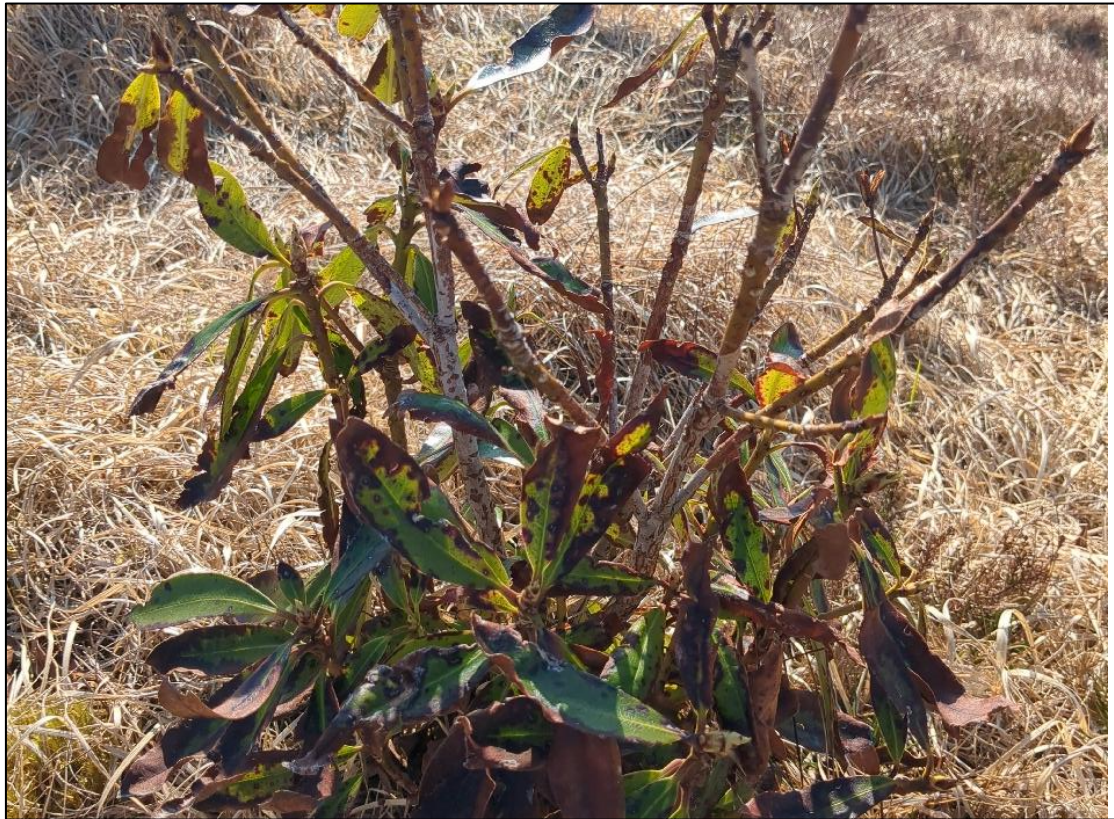
Plate 3-10 Rhododendron found at R10.