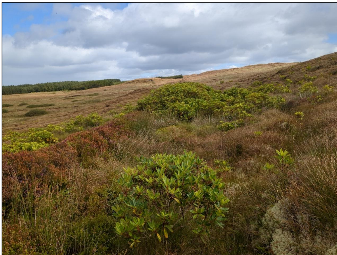
Plate 3-11 Rhododendron found at R11.