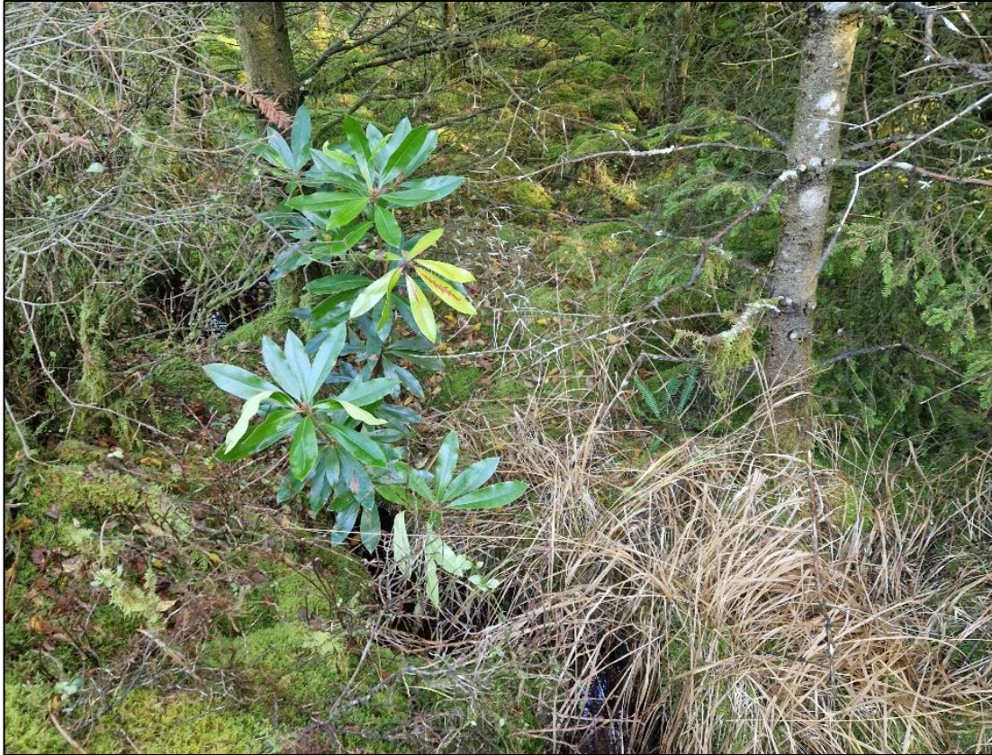
Plate 3-16 Rhododendron found at R16.