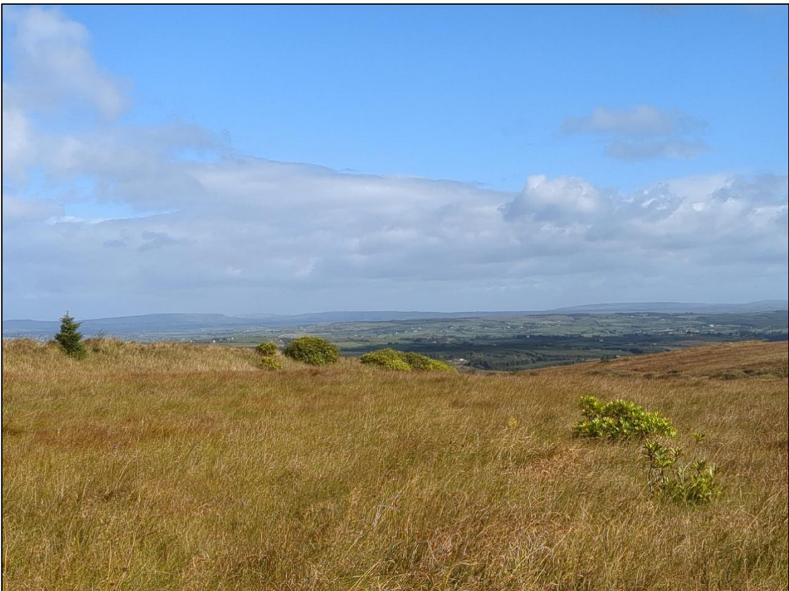
Plate 3-9 Rhododendron found at R9.