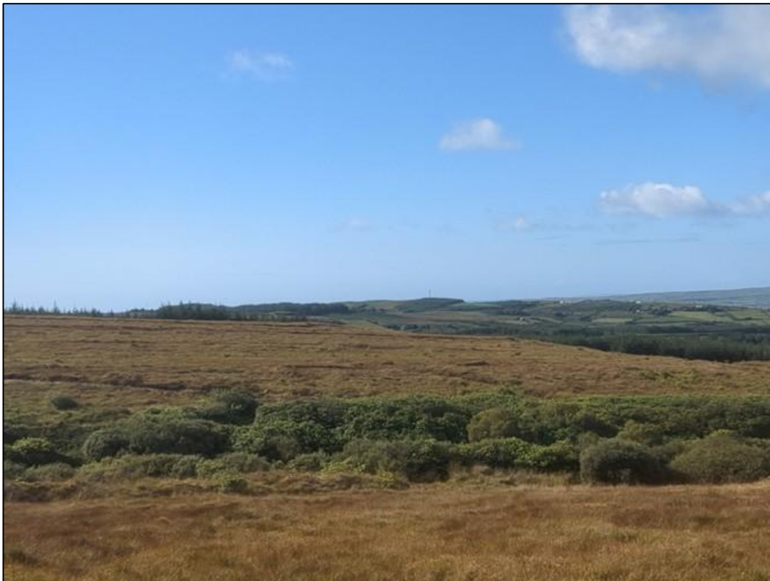
Plate 3-7 Rhododendron found at R7.