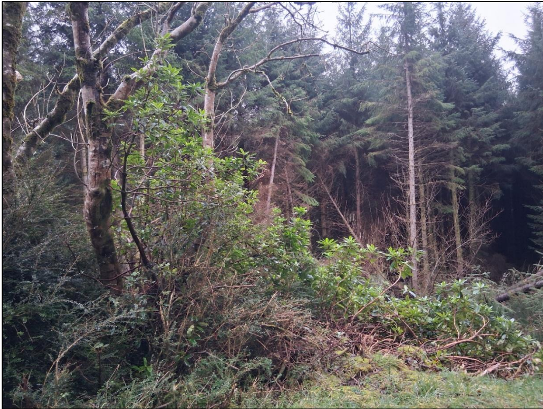
Plate 3-18 Rhododendron found at R18.