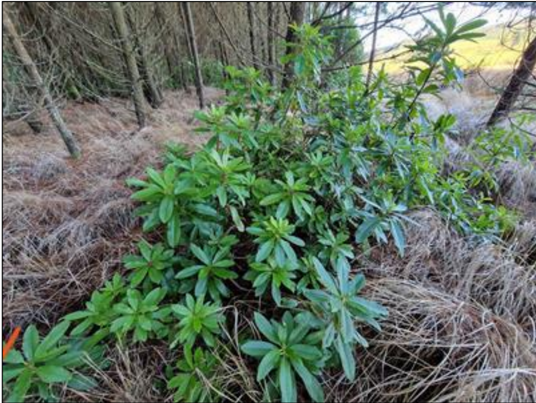
Plate 3-14 Rhododendron found at R14.