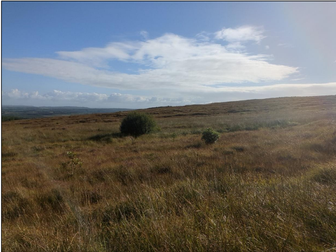
Plate 3-6 Rhododendron found at R6.