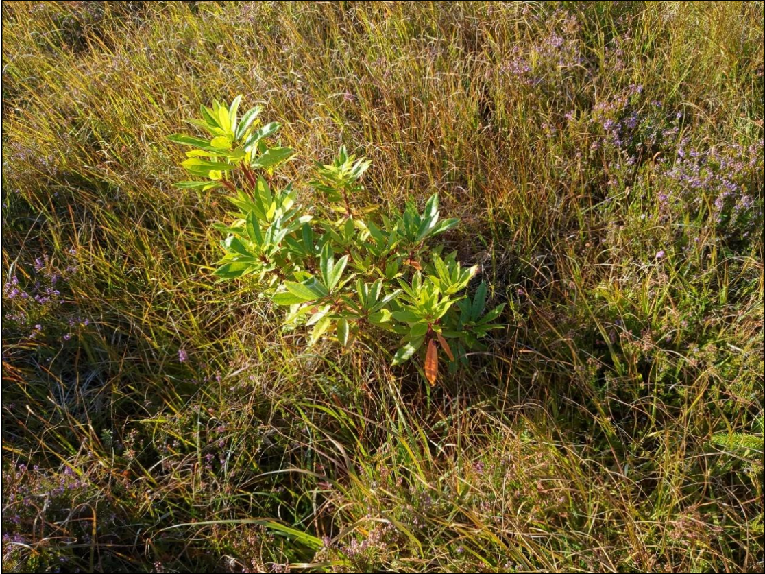
Plate 3-8 Rhododendron found at R8