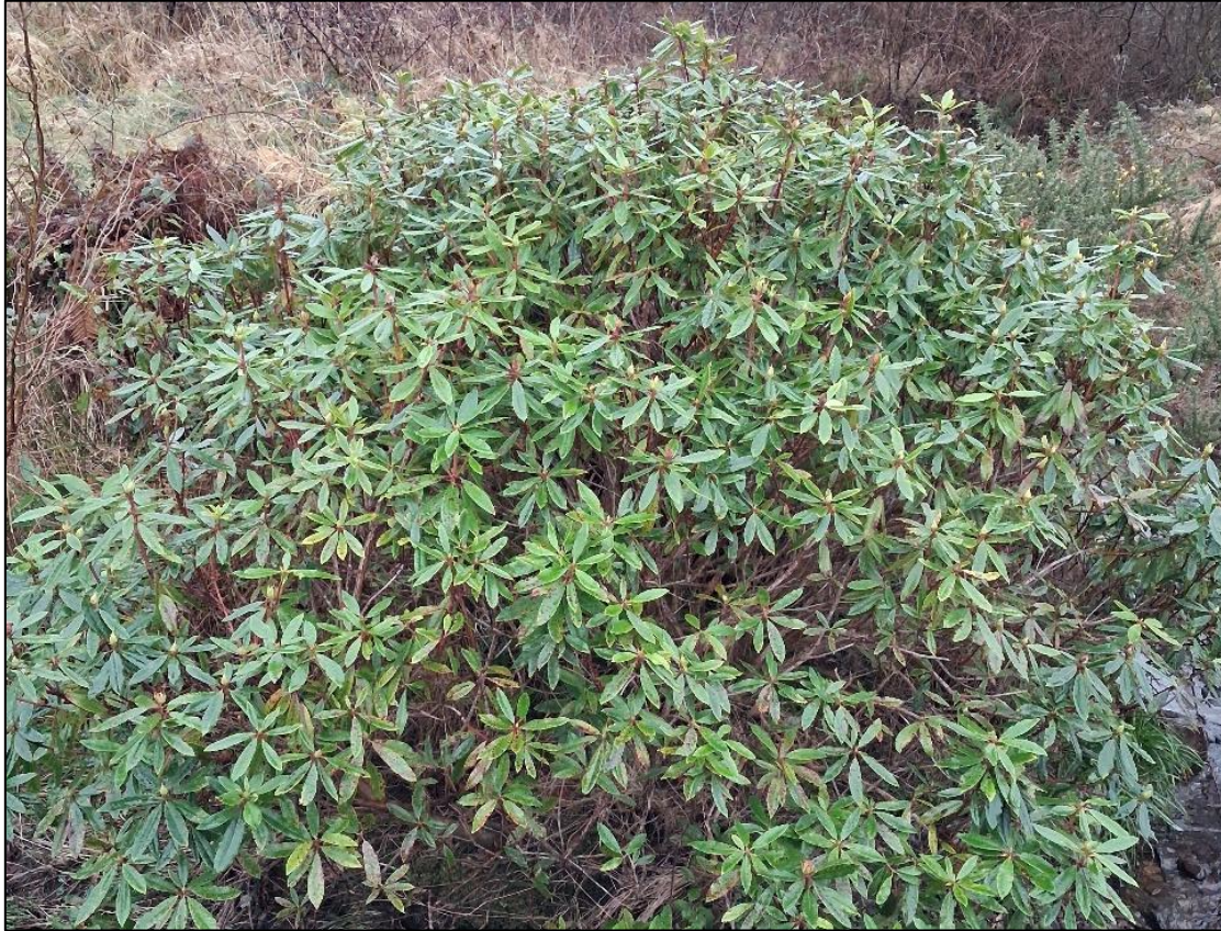
Plate 3-1 Rhododendron found at R1