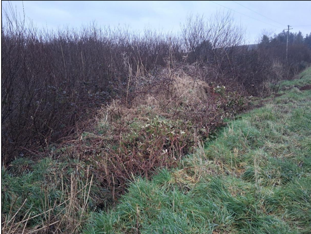
Plate 3-4 Rhododendron found at R4