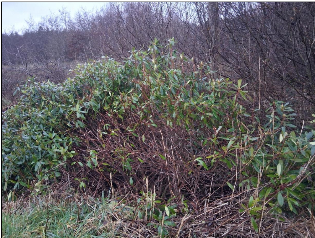
Plate 3-3 Rhododendron found at R3.