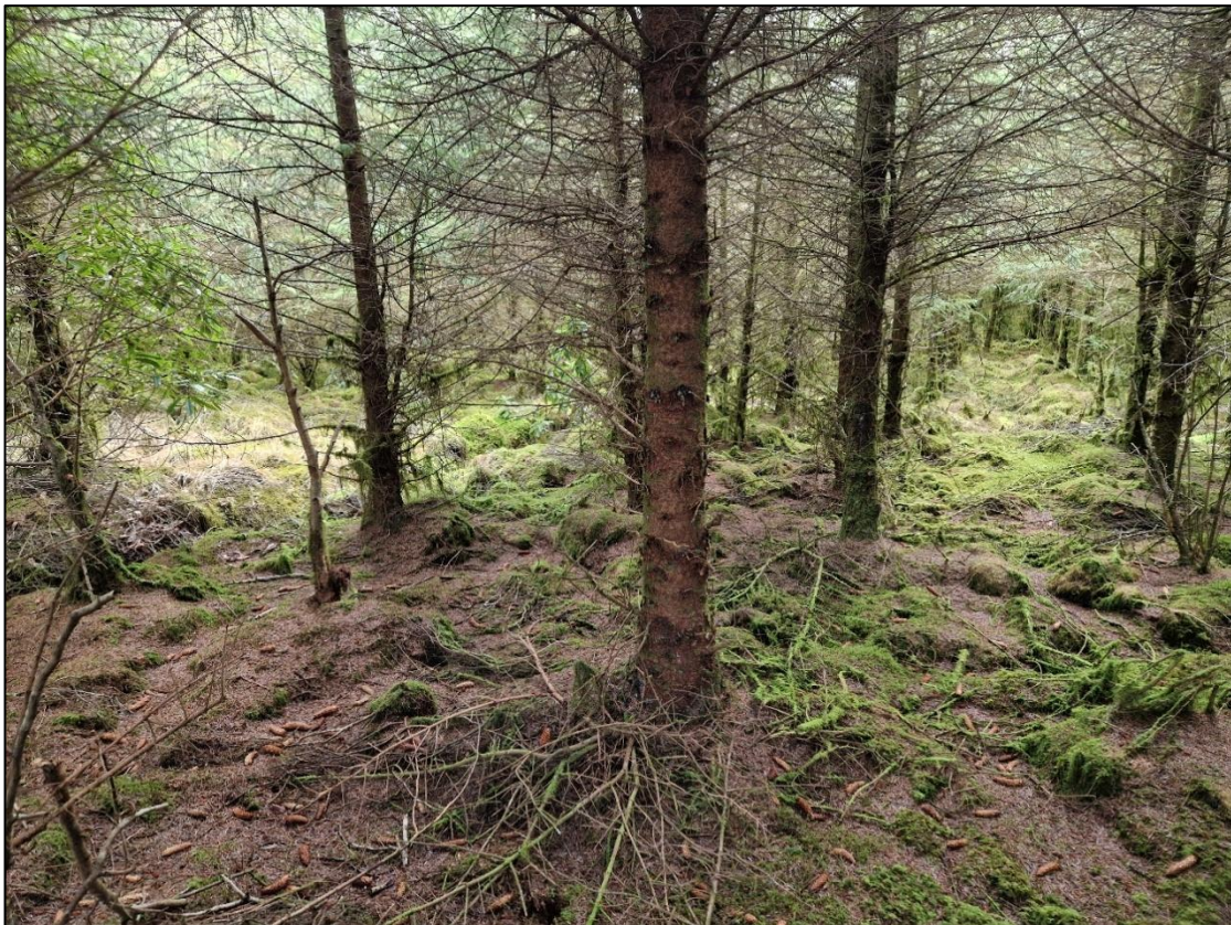
Plate 3-15 Rhododendron found at R15.