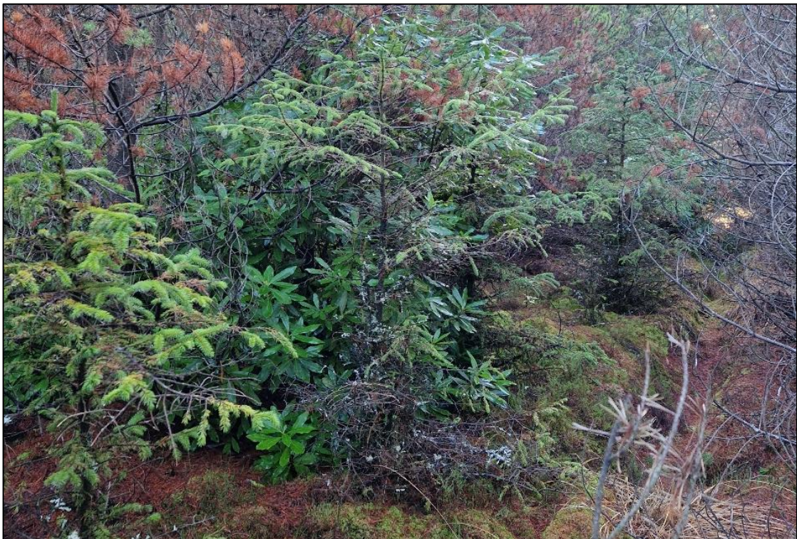
Plate 3-13 Rhododendron found at R13.