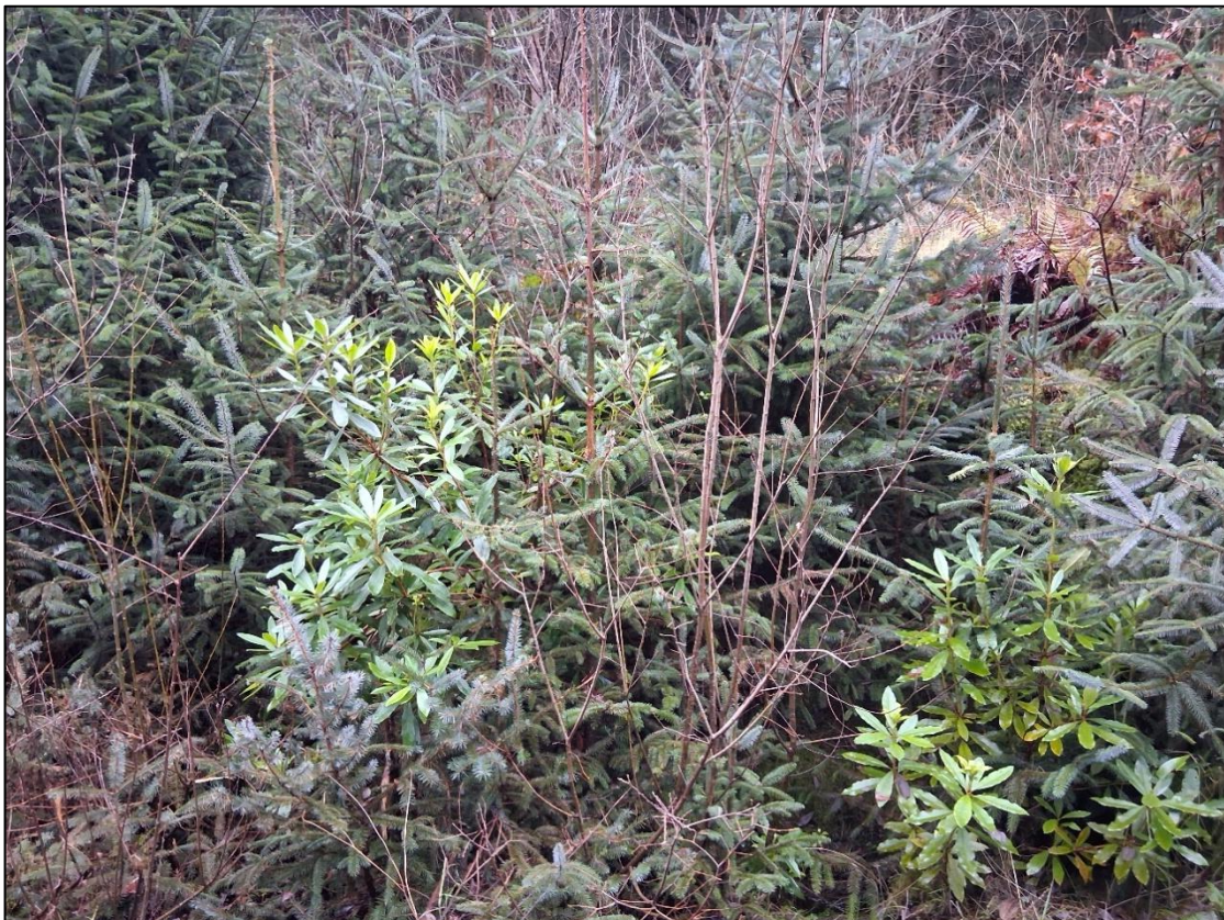
Plate 3-17 Rhododendron found at R17.