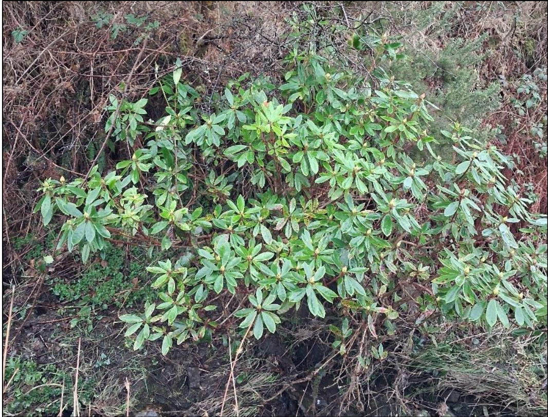
Plate 3-2 Rhododendron found at R2.