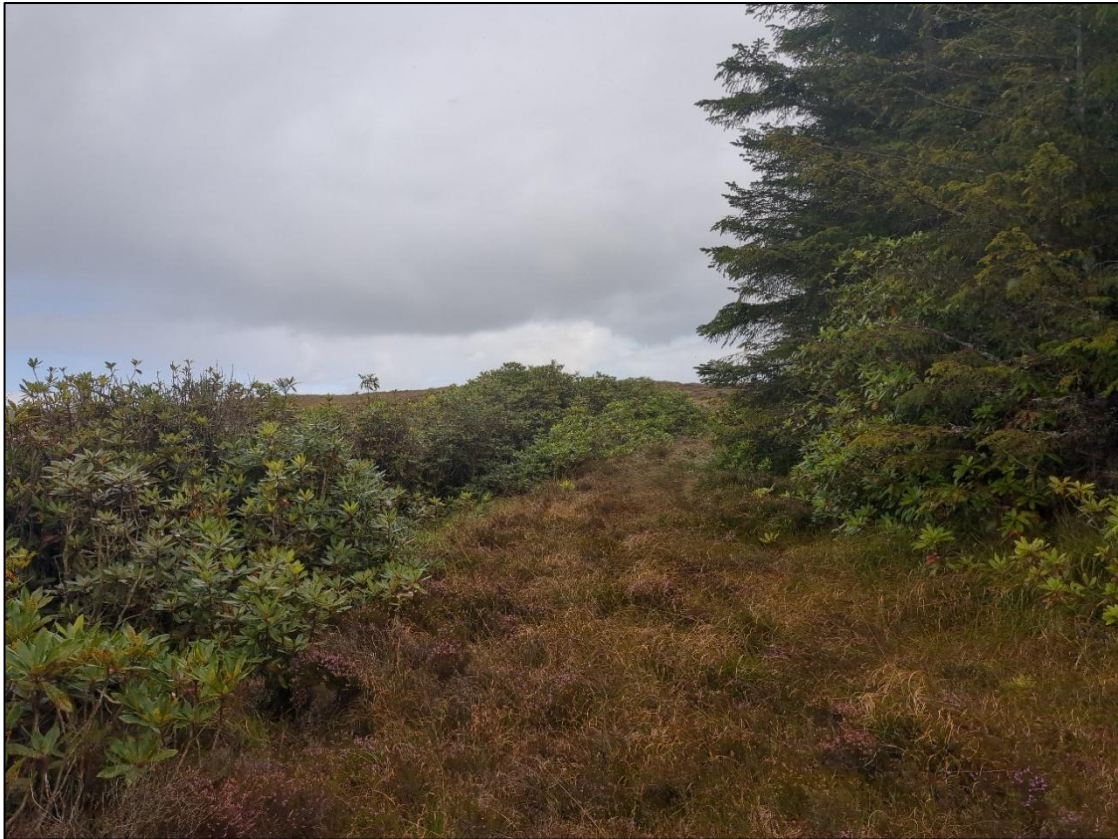
Plate 3-12 Rhododendron found at R12.