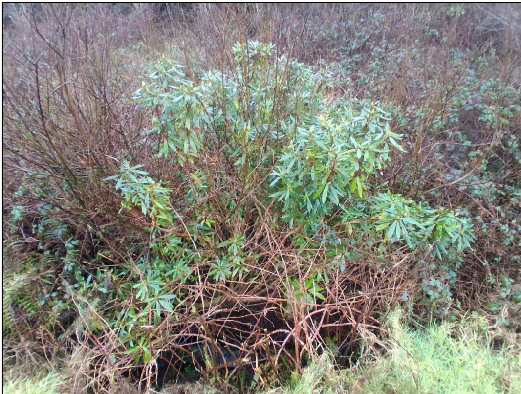
Plate 3-5 Rhododendron found at R5.