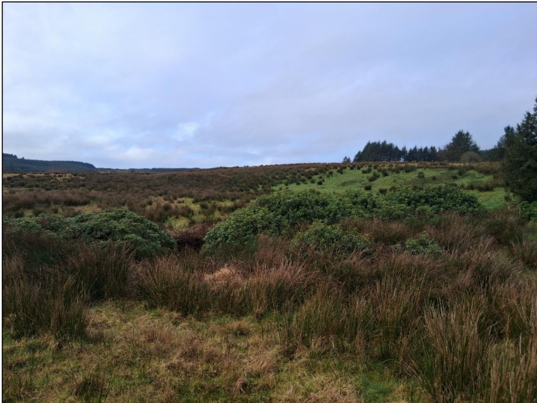
Plate 3-19 Rhododendron found at R19.